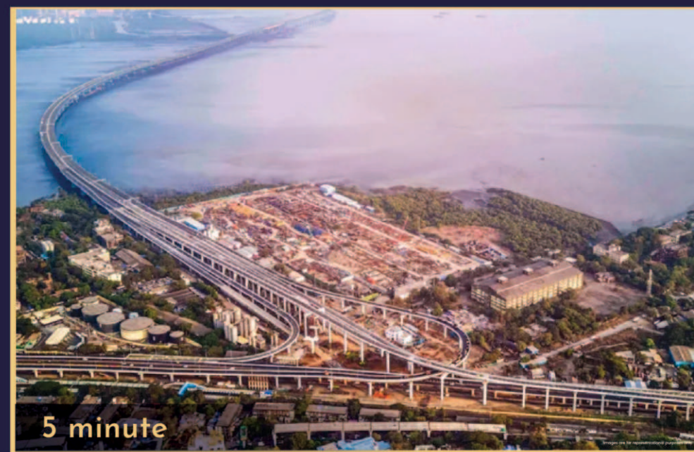
Atul Setu connectivity