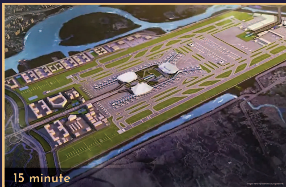
Navi Mumbai Airport