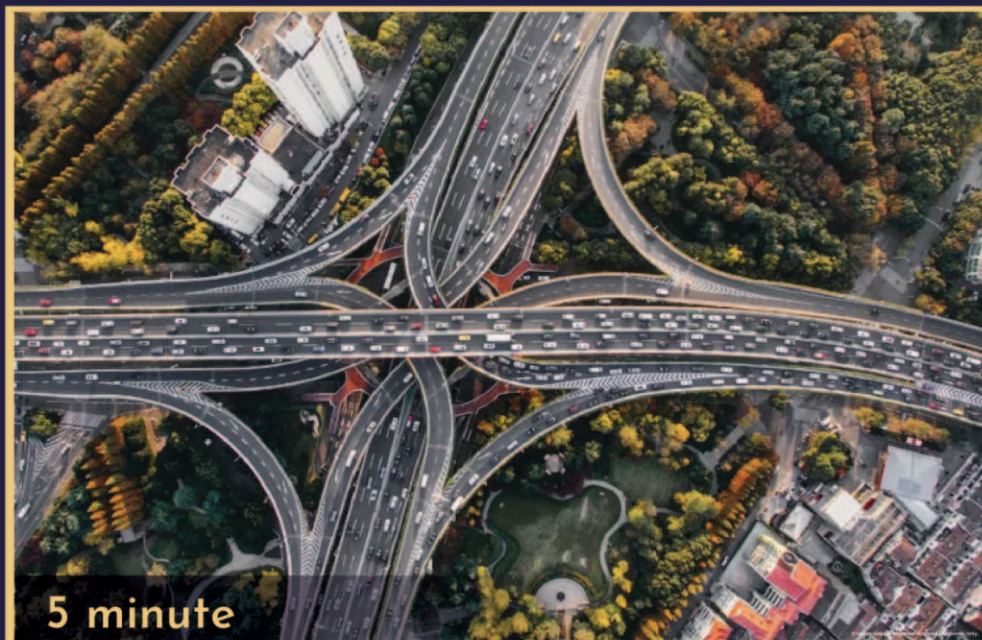
Alibaug -Virar Multimodal Corridor