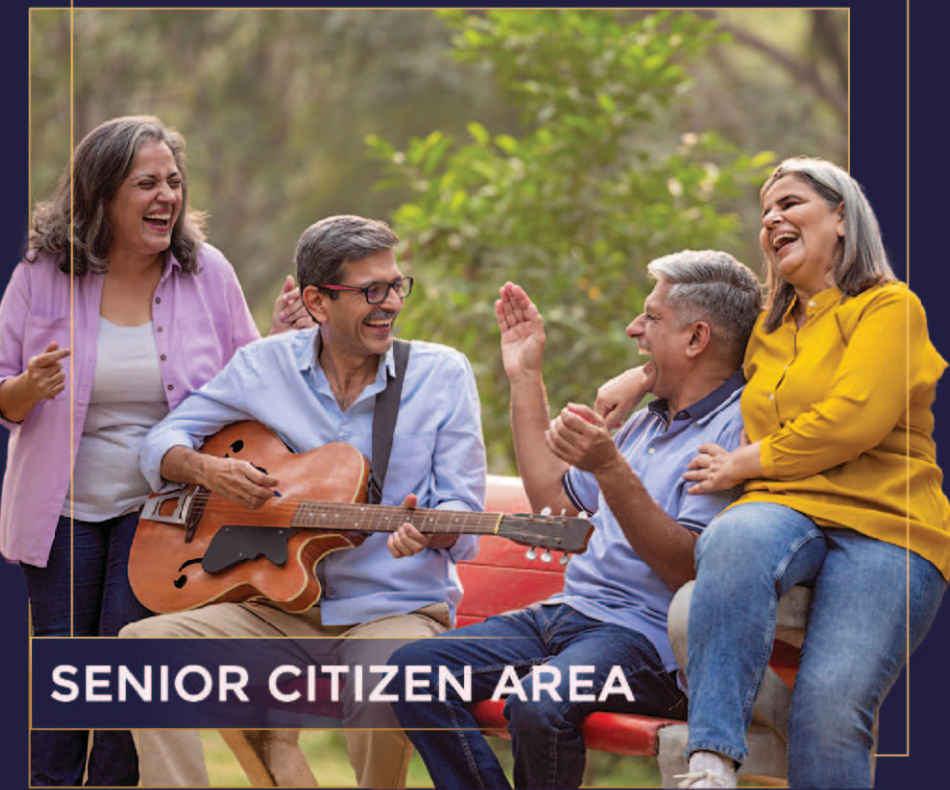
SENIOR CITIZEN AREA