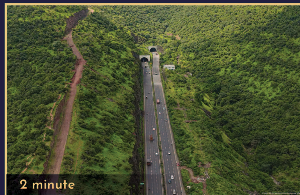
Mumbai Pune Expressway